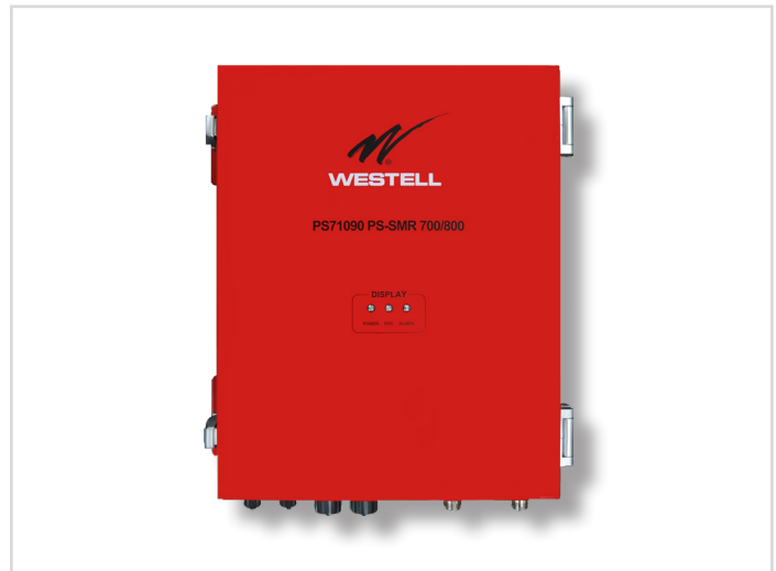
PS71090 NFPA Public Safety Signal Booster